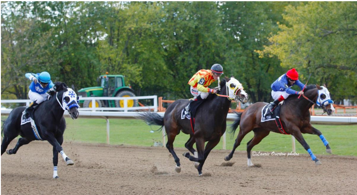
(Photo - COUNTRY BOY 123, #3, on his way to his third straight Alex Picov Memorial Championship victory at Ajax Downs)

AJAX DOWNS, OCTOBER 14, 2019 -Three-time Horse of the Year COUNTRY BOY 123 broke on top and never relinquished the lead on his way to a third straight Alec Picov Memorial Championship Oct. 14 at Ajax Downs.